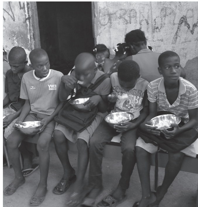
Children in Pax Christi Haiti's Education and Soccer Program, 2008

Our hearts are broken by the devastation wrought by the earthquake in Haiti yesterday. Pax Christi USA expresses our deepest sympathy and grief for our Haitian sisters and brothers affected by this disaster. We are especially concerned for our colleagues with Pax Christi Haiti and their families. As of Wednesday afternoon, their safety and whereabouts were still unknown. We